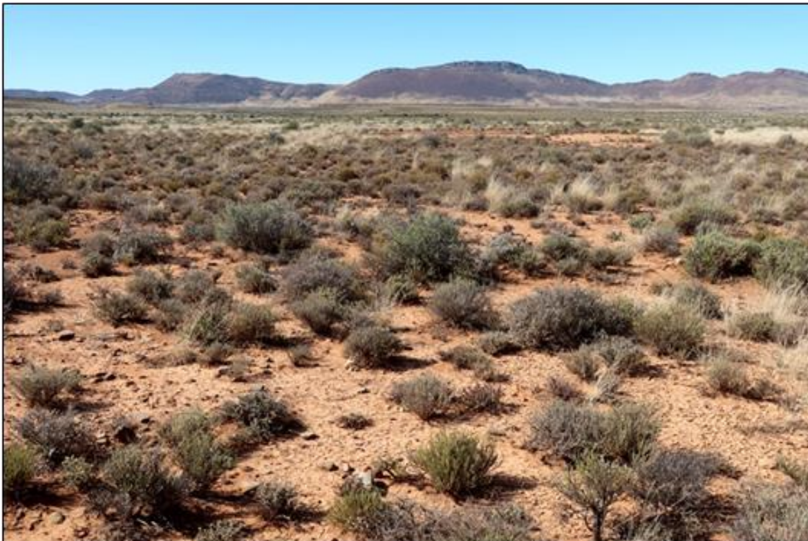
Figure 2:Flat, sandy to gravelly terrain within the Soutrivier South project area on Farm RE/195.