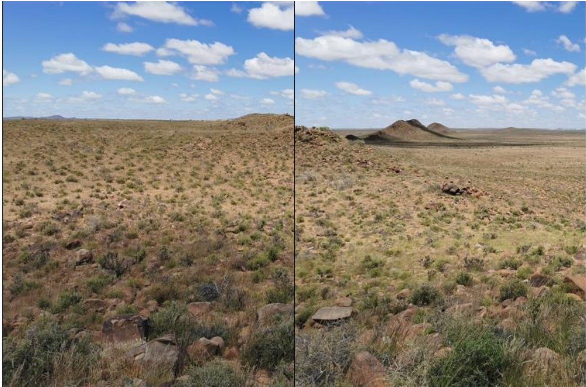
Figure 1:View of general surroundings in the project area.