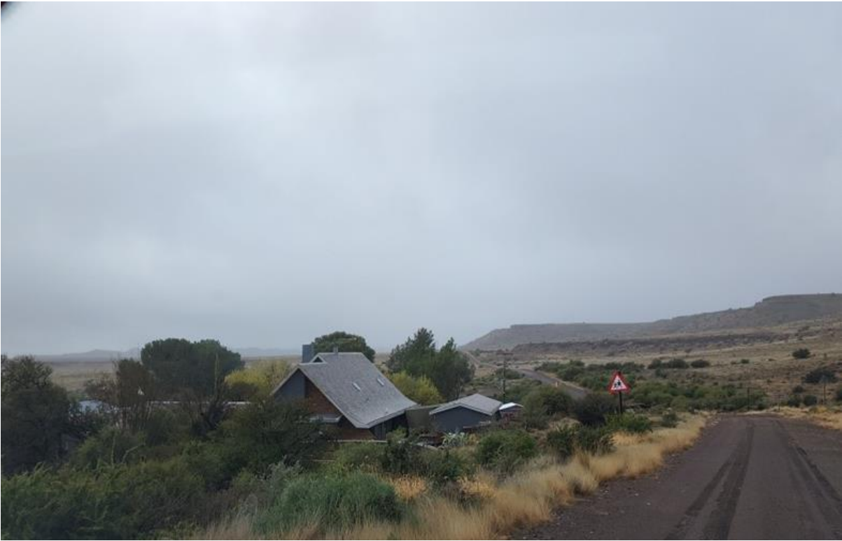
Figure 5: Typical transformed area associated with a dwelling and an unpaved gravel road