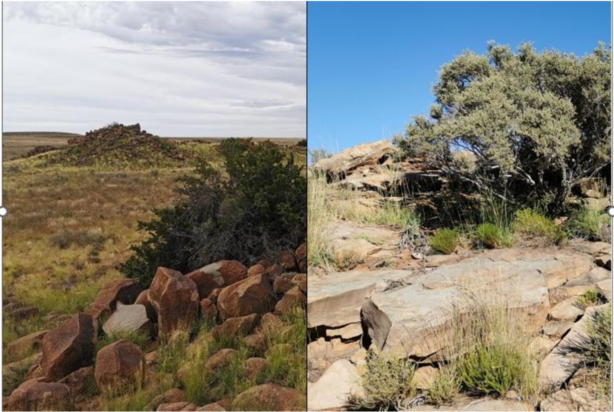
Figure 3: Typical rocky dolerite outcrop and vegetation observed.