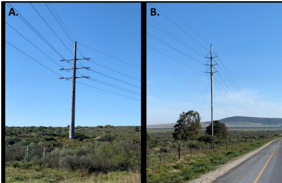
Proposed steel monopole structures. A) Strain Structure. B) Intermediate Structure.