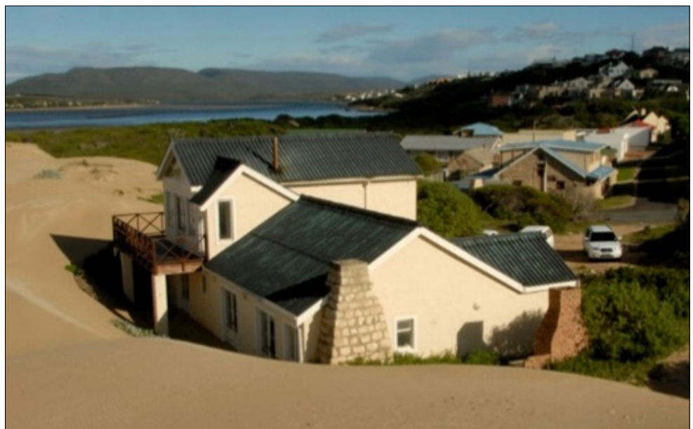
Figure 1: A property at Witsand on the southern Cape coast.

Imagine having purchased a beach house along the Cape coast on a fine summer day to spend family holidays relaxing and enjoying South Africa's marvellous coastal environment. Then, on a visit to the beach house in the winter, when a strong southeasterly wind is blowing, you find that the dunes that naturally migrate along the shore are approaching your house at a rapid rate. When you approach a local environmental consultant, they assure you that, with permission from the authorities, you can stabilise the dune system and divert those sands away from your property.