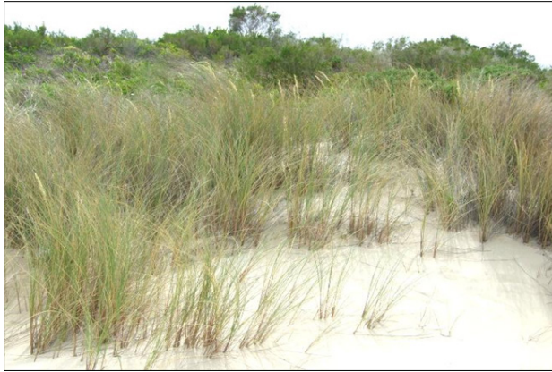
Figure 2: Ammophila arenaria (marram grass) at Oyster Bay being replaced by shrubs with coastal scrub in the distance.

in numerous regions, sometimes over >100 ha in extent, by the then Department of Forestry as part of an extensive stabilisation programme of mobile dune systems. 8 These stabilisation programmes were often inappropriate as dune studies at Rhodes University and the Coastal Research Unit at Nelson Mandela University only later showed. At this time, Roy Lubke and Ted Avis published their illustrated pamphlet. 1