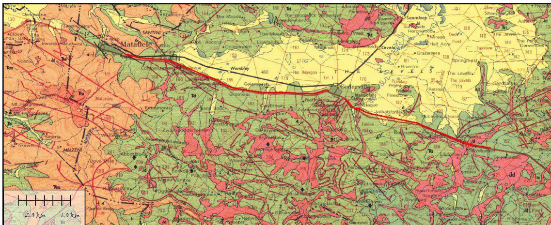
Figure 4.1 Geology of the M56. Mainly underlain by rocks of the Tarkastad Subgroup and Alluvium

The study area is underlain by Triassic aged sandstone and red mudstone of the Tarkastad Subgroup (Trt) of the Beaufort Group, Jurassic aged Dolerite of the Karoo Supergroup and Tertiary aged Alluvium (Figure 3.1).