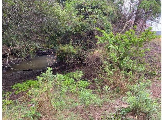
Mainstem watercourse typical of the area, with a defined although narrow riparian zone, but also showing the level impact and invasive vegetation that occurs at many of the proposed areas that the grid will need to span.