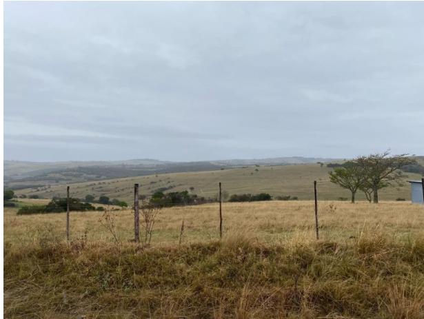
Upstream view of a typical watercourse with natural vegetation (trees) along the central portion of the alignment.