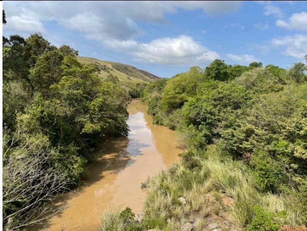
Lower reaches of the Qinira River after heavy rains, that will be spanned by the proposed OHL cable route to Neptune.