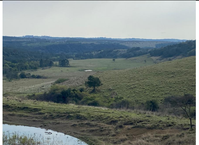
A higher number of small farm dams are located along the alignment, with one small seepage zone feeding the lower valley