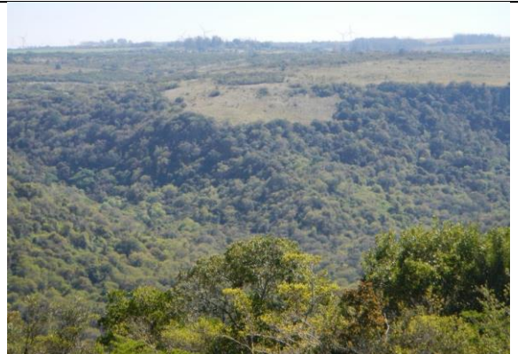
Buffels Mesic Thicket