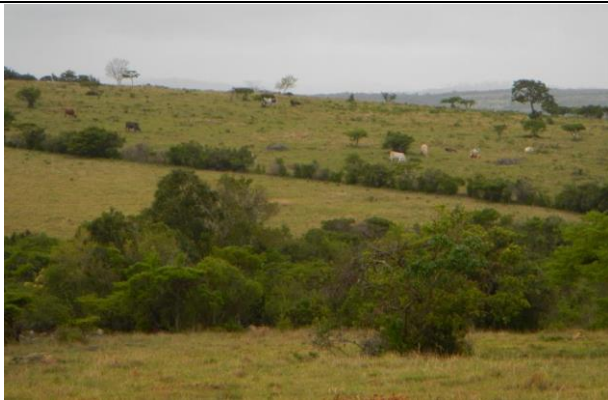
South Eastern Coastal Thornveld