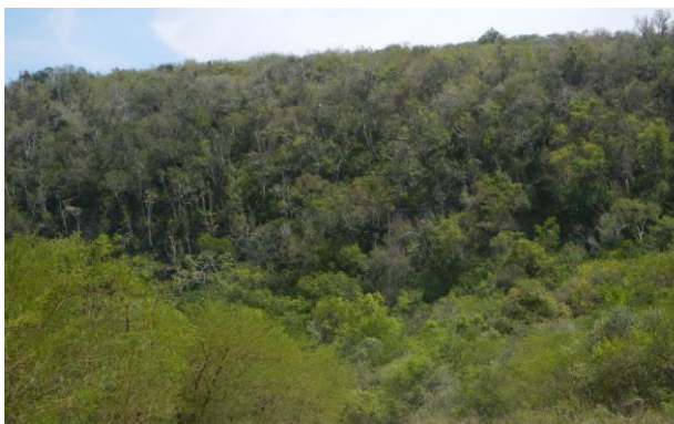
Buffels Mesic Thicket